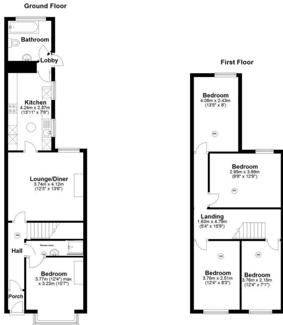
74 Raddlebarn Road, Birmingham